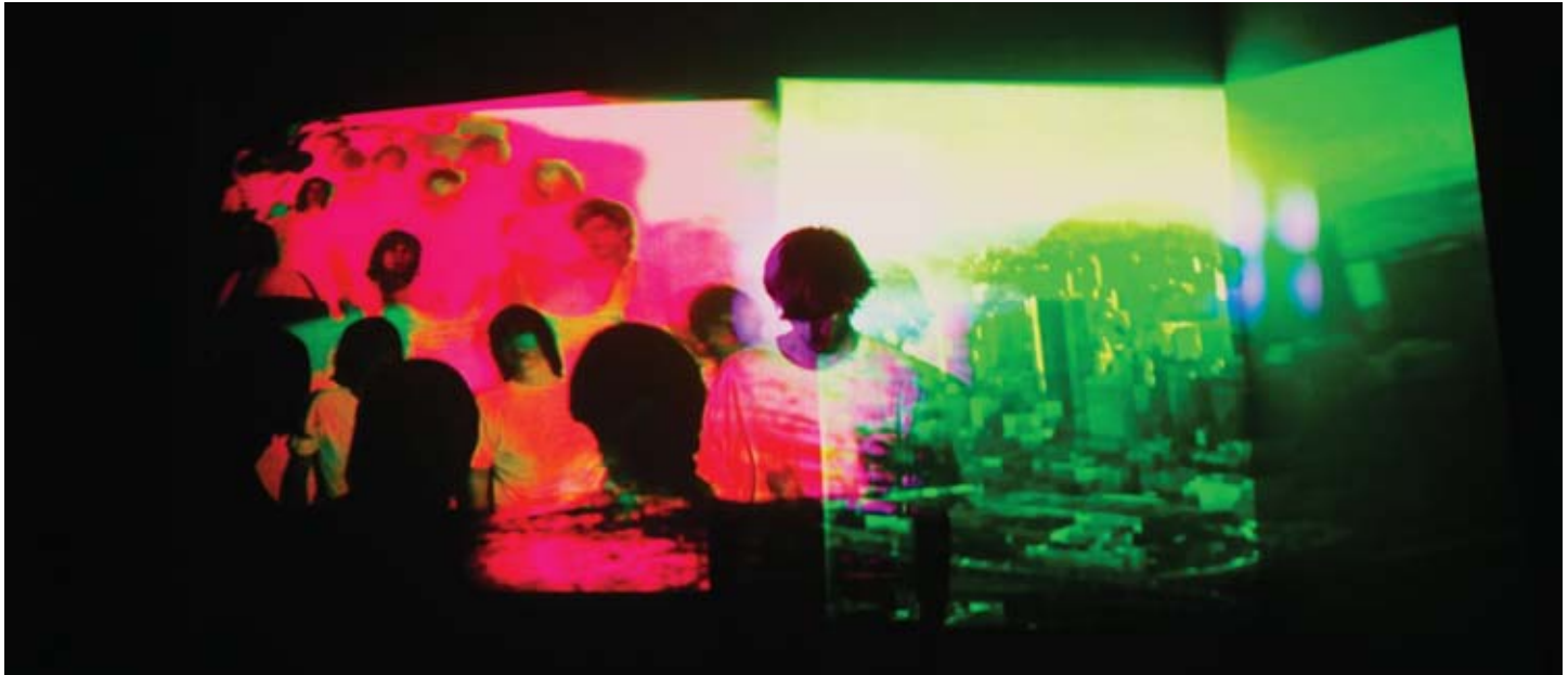
Cut Copy, In Ghost Colours