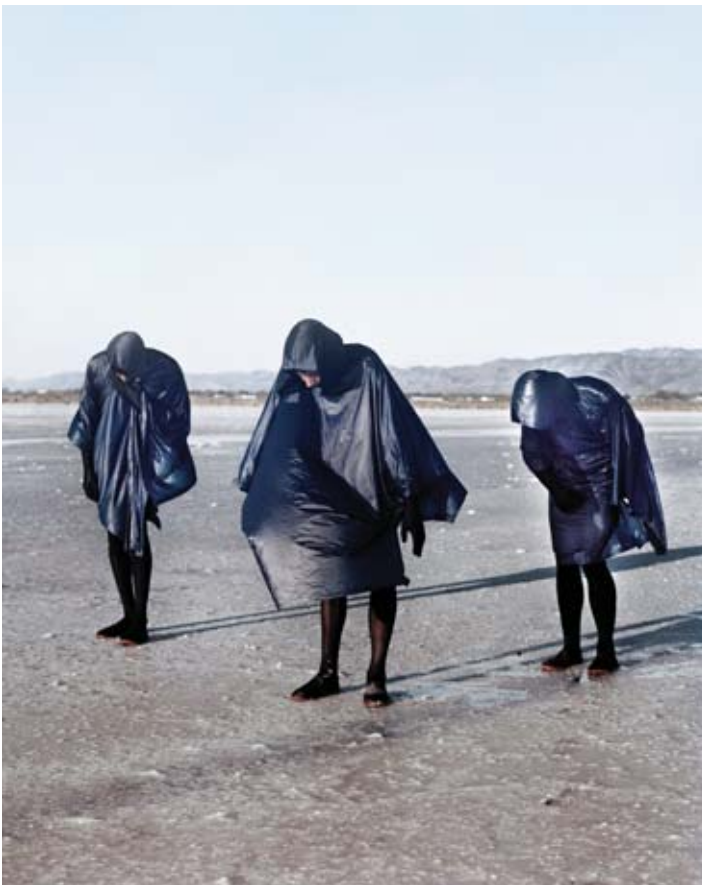
My Disco, Paradise