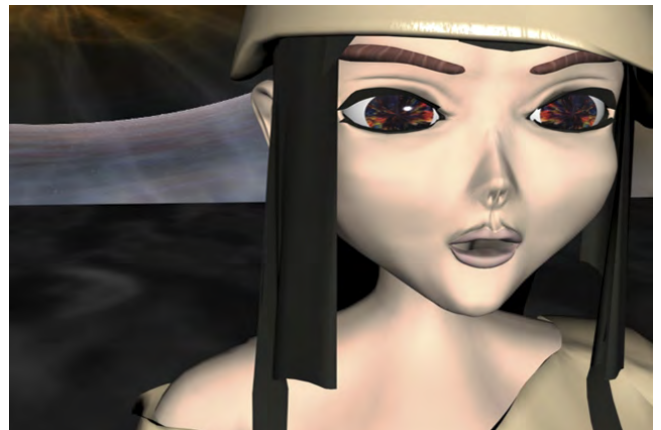
Cao Chong 3D Max Animation