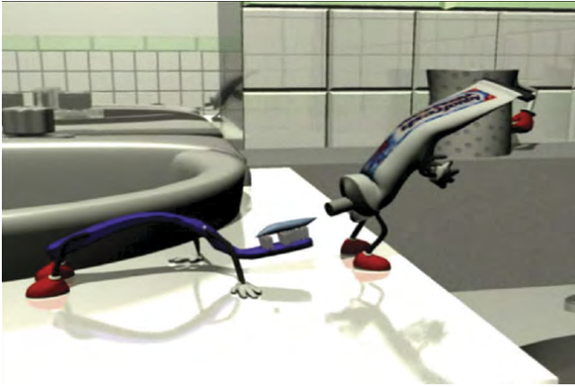
C-June Liang 3D Animation