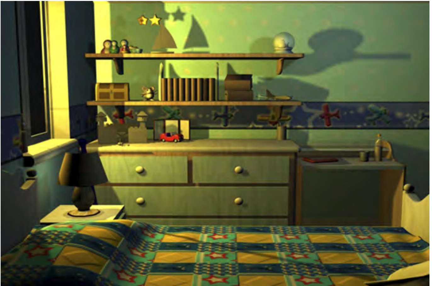
Students Group Work Virtools 3D Game