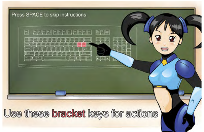
Nik Situla 3D Flash Game