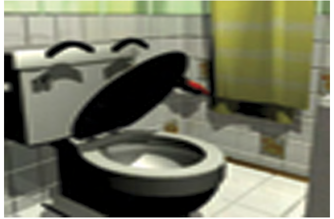
C-June Liang 3D Animation