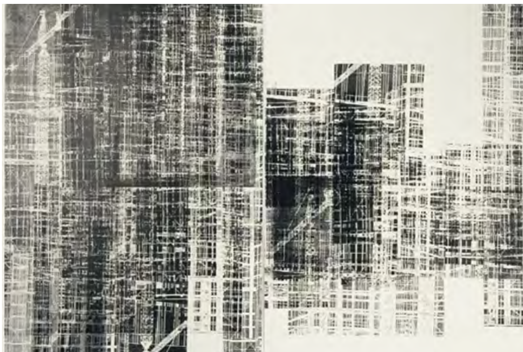
Bettina Hill Constructs