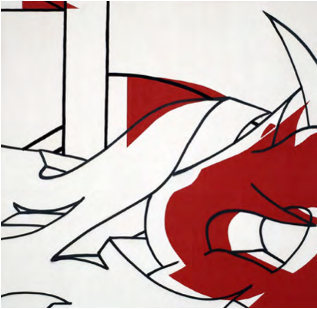
Alan McGovern Composition 1-Series 1