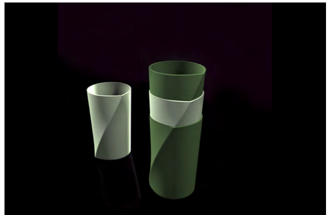
Mathew Little Screw Cups