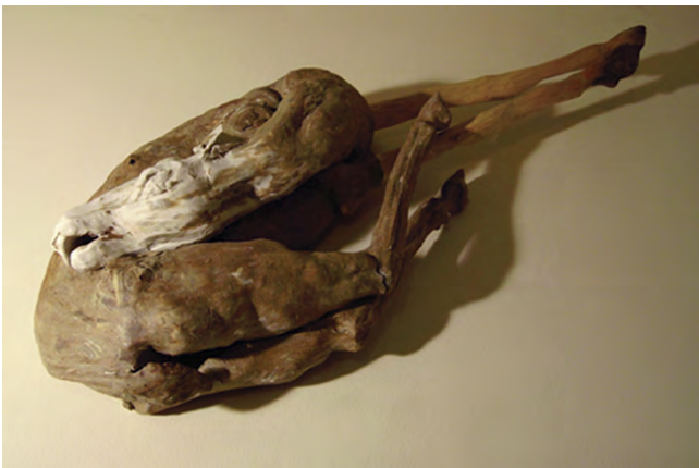
Gosia Pilat Syndrome of need