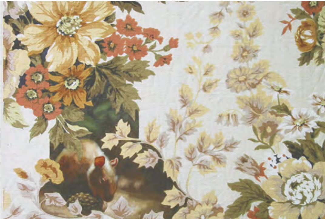
Tiffany Cole Mouse