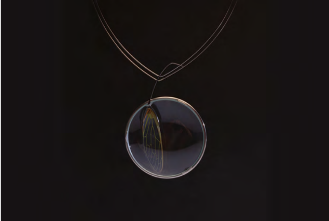
Mia-Lee Ching Remind Me To Fly