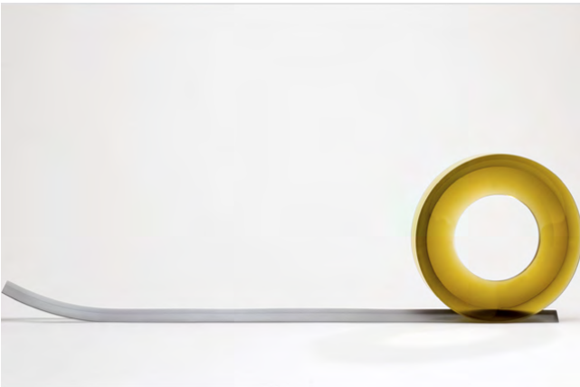
Charles Butcher Silence