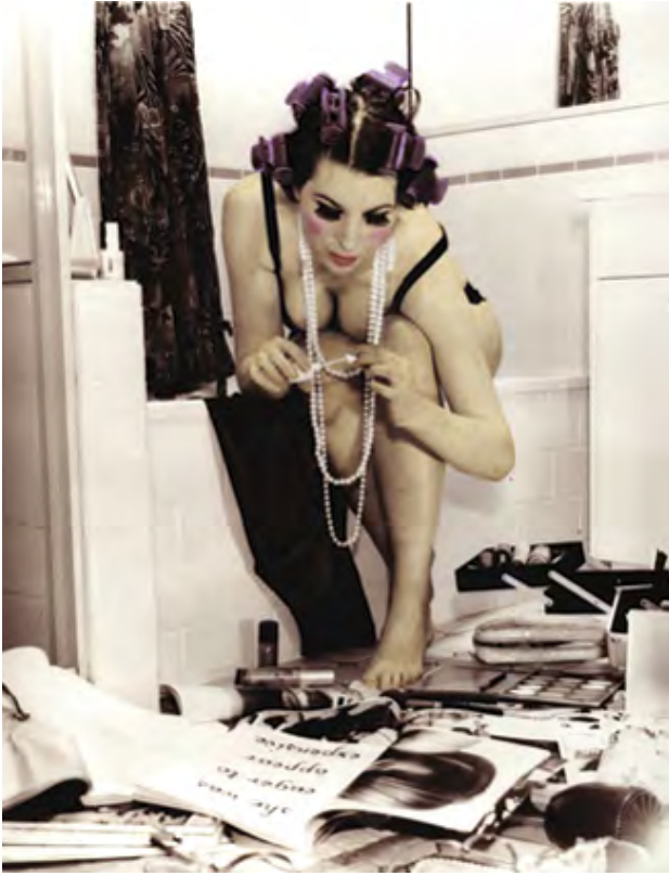
Majella Brown Bathroom