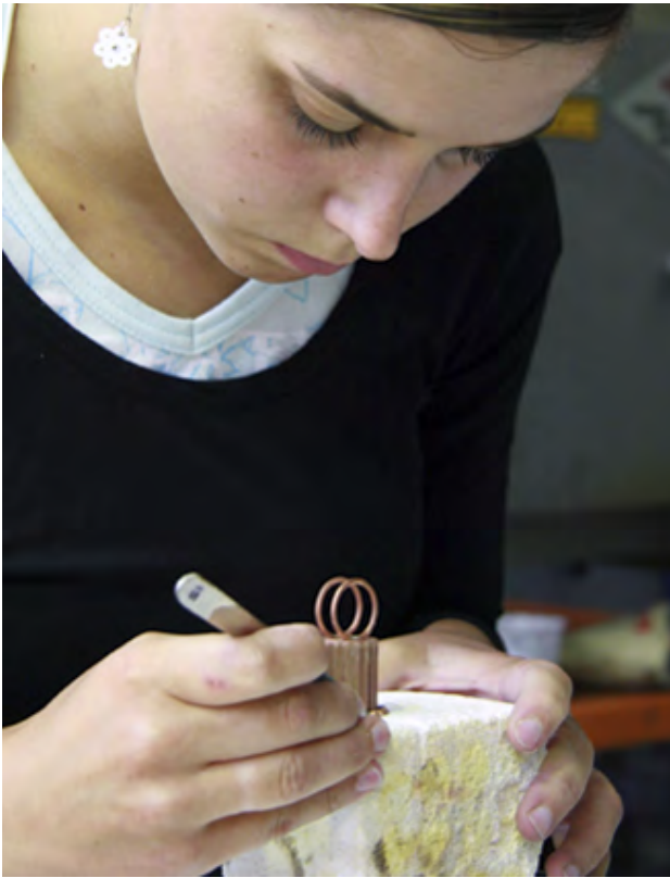
Gold & Silversmithing Workshop