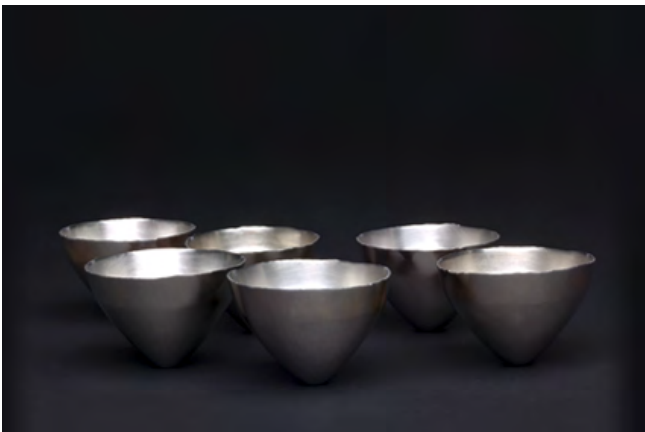
Eileen Procter Plato's Republic (detail)