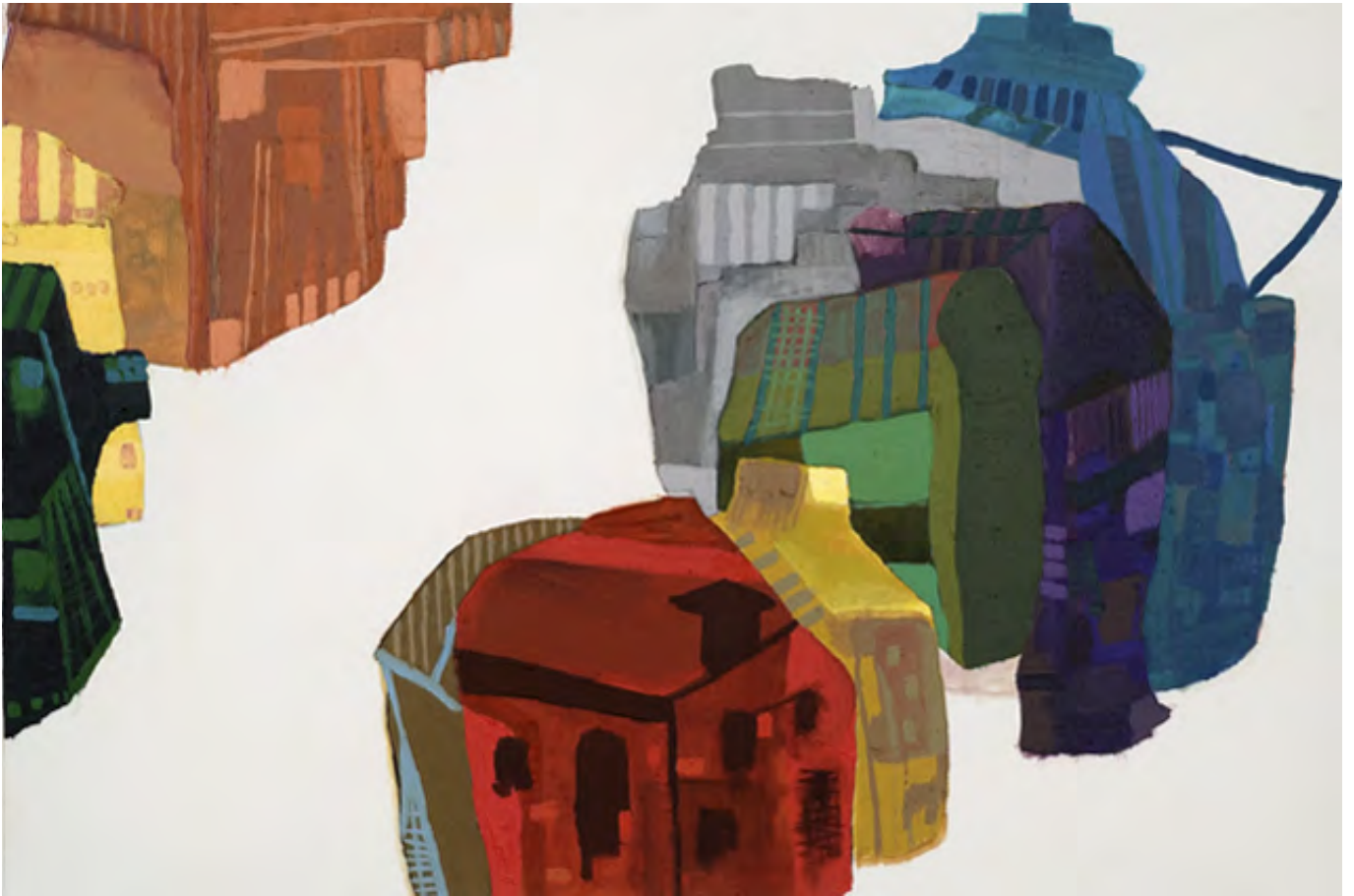
Elena Papanikolakis Untitled