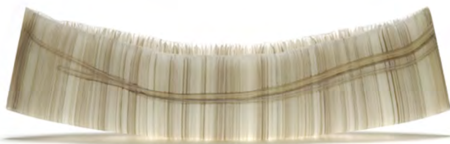
Cobi Cockburn Swathe