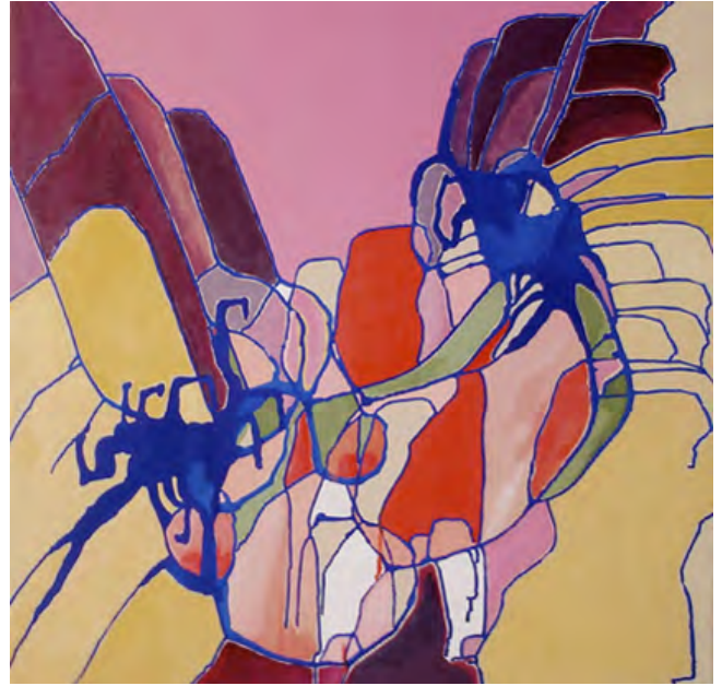
Tania Evans Plankton