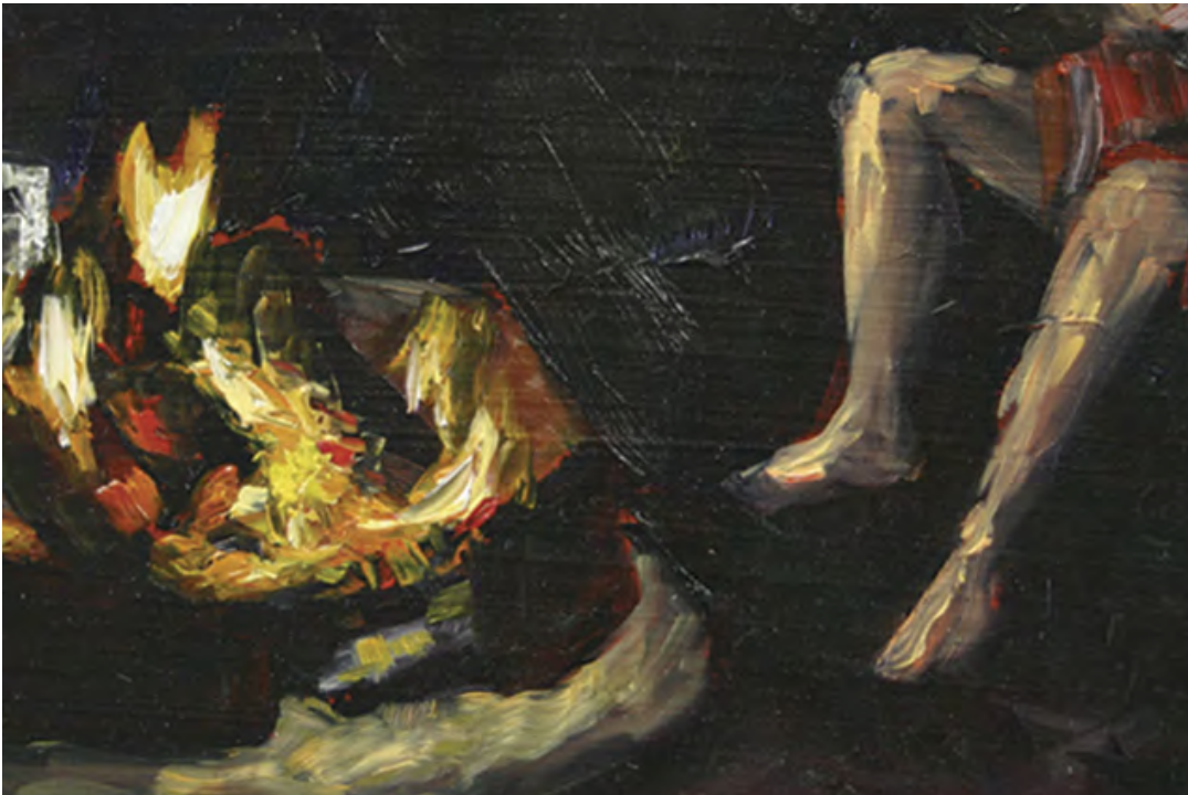
Erin Carew Diploma of Visual Arts Camp fire at night Oils on board