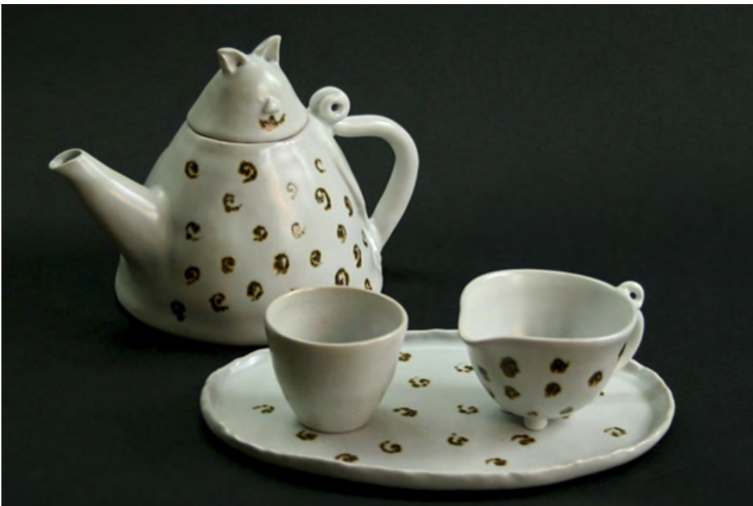
Sonja Louie Diploma of Ceramics Stoneware - Cat tea set