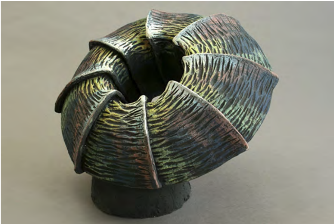
Monica Finch Diploma of Ceramics Stoneware - Sculpture

Dandenong campus Department of Creative Arts