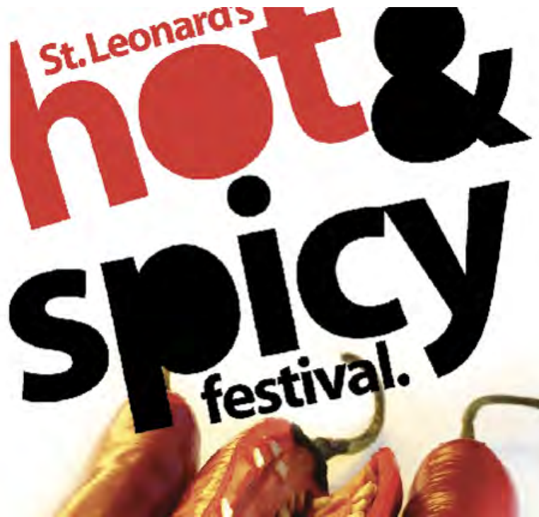
Joel Parke Diploma of Graphic Art Calendar cover design for food and wine festival

Dandenong campus Department of Creative Arts