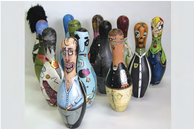
Various students from the Diploma of Illustration "Pins" Diploma of Illustration