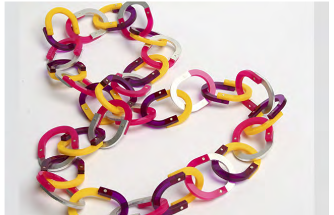
Melanie Ntentis "Linked" Diploma of Arts - Product Design